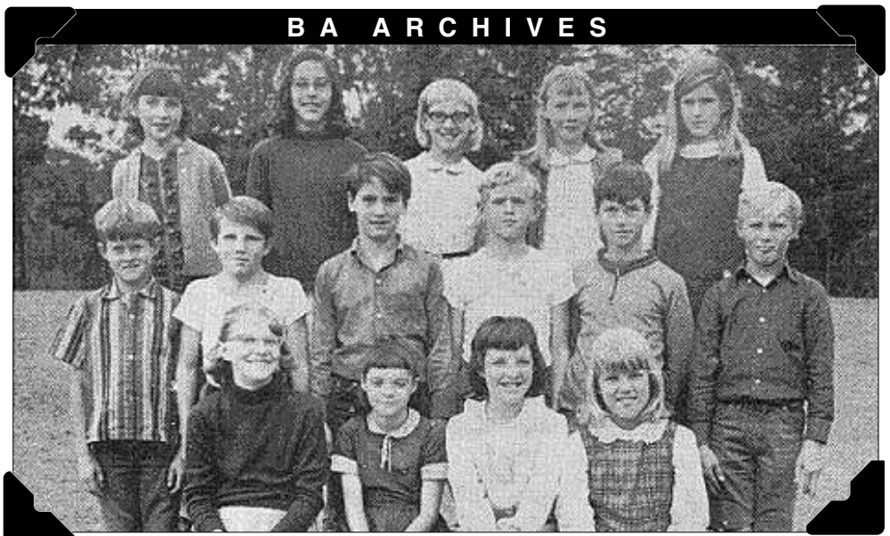
Bingham Academy Fifth Grade