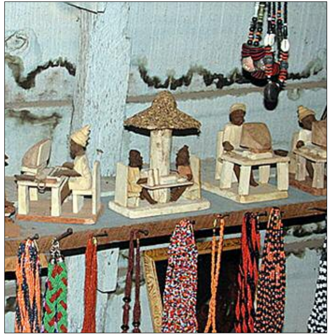
Thorn carvings. Note figures at computers.