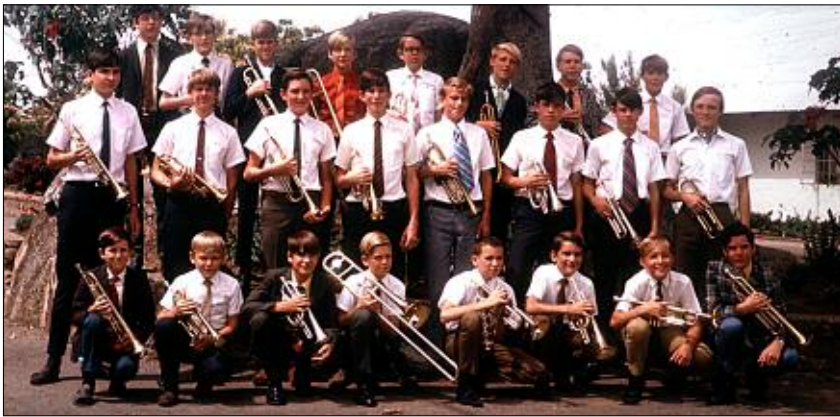
Trumpet players 1972