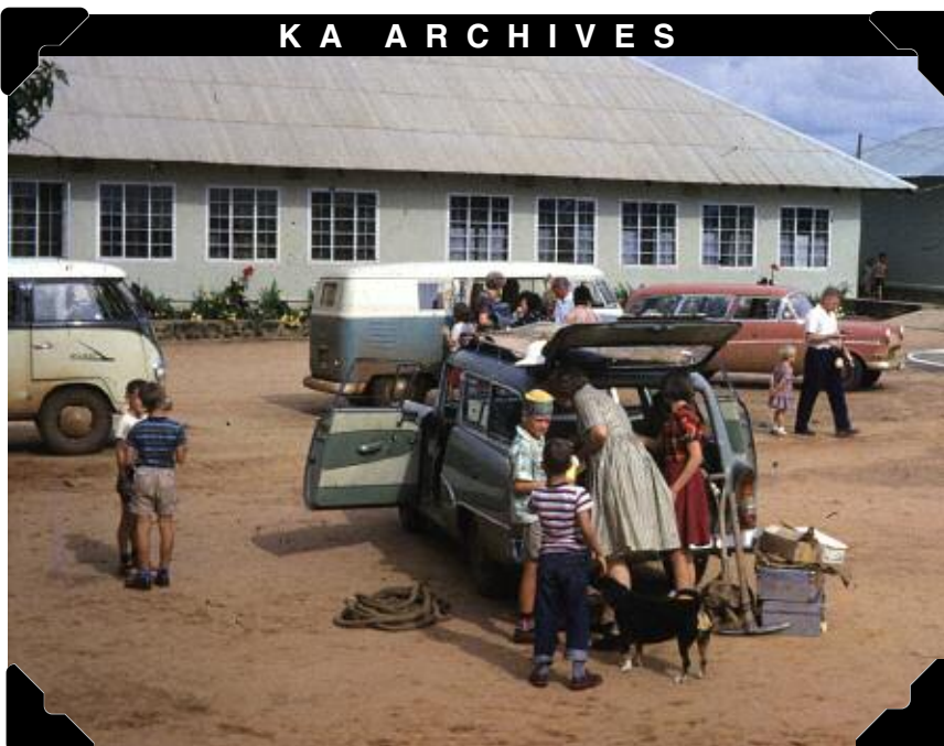
How many times do you remember this scene at KA?