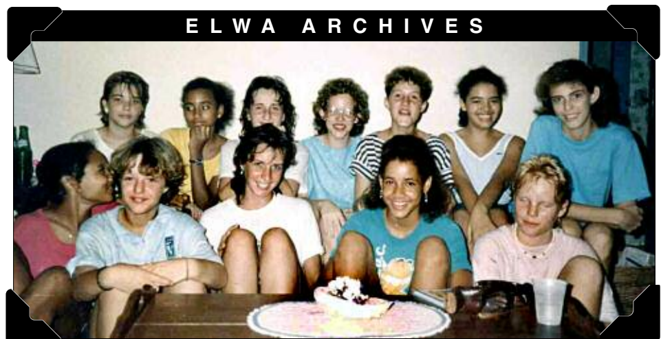
Can anyone identify these MKs?